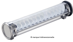
Gounod 133